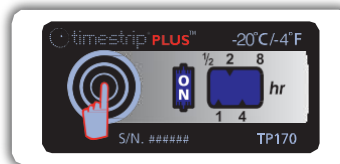
3. -20 °C breached for 8 hours

1. Activation: The indicator must be at -20 °C/-4 °F or more to activate. Fully squeeze the button between thumb and finger. A blue line and ON will appear. Within 5 minutes, place the Timestrip® PLUS below -25 °C/-13 °F for a minimum of 1 Hour. This will arm the indicator so it can begin to monitor temperature. If the item or carrying card is already below -25 °C/-13 °F, the indicator can be stuck to it directly after activation.